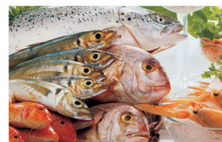
Cold water fish are a great source of vitamin D.

“Research suggests that vitamin D may help prevent osteoporosis, high blood pressure, cancer and some auto-immune diseases”