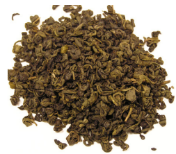
Gunpowder green Tea on Sale this month

Available at Vitality (and soon to be online at www.arcanahealth.com )