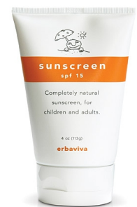
New Erbaviva Sunscreen now available at Vitality Natural Wellness Clinic

P.S. We also have natural deodorants by the same company which are fantastic!