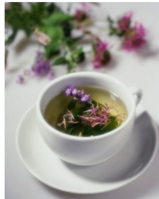
Green tea and lavender...the perfect match for your skin

The witch hazel will help to tone the skin, while the green tea will help protect the skin from the sun's harmful rays. The lavender will soothe sun damaged skin. Keep the spritzer in the fridge for an extra refreshing spray