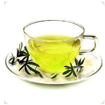
Green tea contains skin-cancer fighting compounds called epigallocatechin-3-gallae (or EGCG for short)